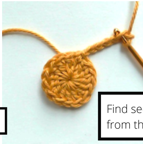
Find second chain from the hook