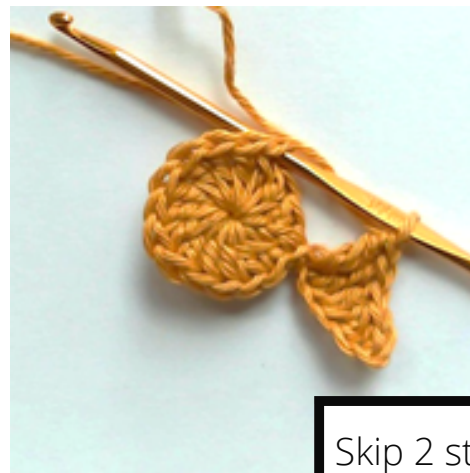
Skip 2 stitches from round 2, sl st in 3rd